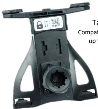
Tablet clamp Compatible with 7.9" up to 13" devices